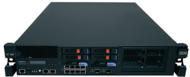
IBM WebSphere DataPower Integration Appliance XI52

IBM WebSphere DataPower appliances are designed to maintain the highest levels of reliability. These IBM appliances help you untangle the costly and debilitating IT complexity that is associated with point-to-point connectivity and integration, application and data security, API management and security, and enterprise mobility. Experience an appliance that helps you make the most of your existing infrastructure investments. The IBM WebSphere DataPower Integration Appliance XI52 delivers operational cost savings by providing advanced integration and security capabilities without any changes to your existing applications, resulting in rapid time-to-value on your investment.