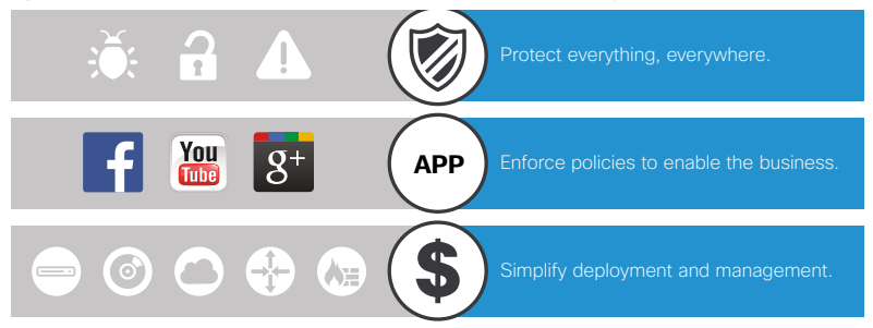
Figure 2. Critical Elements of Comprehensive Web Security

Protecting every device, every user, and every bit of data that crosses the enterprise network requires an adaptive and responsive—as well as architectural—approach. Cisco network-based security architecture is that approach. Its components (see Figure 3) present a closed-loop solution that allows enterprises to defend against, discover, and remediate threats originating from the web. It also helps enterprises better manage the security risks of borderless networks, so workers can globally access the network with their device of choice and use the applications and information they need to do their jobs.